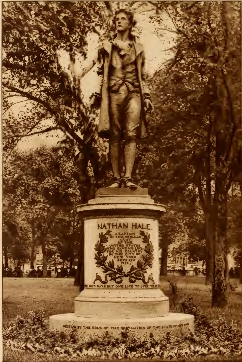
STATUE OF NATHAN HALE. Handsome memorial, presented to New York State by Sons of American Revolution. Hale's famous words are inscribed on monument.